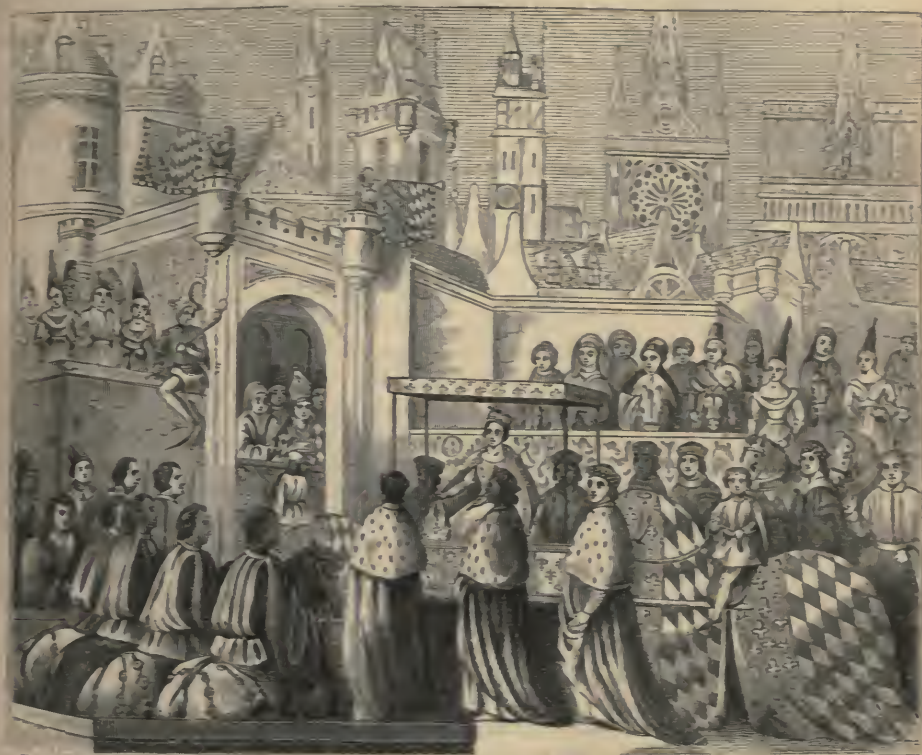
TRIUMPHAL ENTRY OF QUEEN ISABELLA INTO PARIS. From a MS. Froissart of the 15th century.

of Berry, and the daughter of the lord de Coucy, in an open and ornamented litter, led by sir James de Bourbon, and sir Philip d'Artois. Then the duchess of Bar and her daughter, led by sir Charles d'Albret and the lord de Coucy. There was no particular mention made of the other ladies and damsels who followed in covered chariots, or on palfreys, led by their knights. Serjeants, and others of the king's officers, had full employment, in making way for the procession, and keeping off the crowd; for there were such numbers assembled, it seemed as if all the world had come thither.